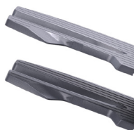
Copy Tray (D)