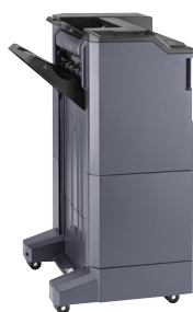
DF-7110 4,000 Sheet Finisher 65 Staple / 65 Manual Staple