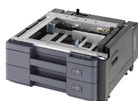
PF-730 (B) 2 x 500 Sheet Tray (Ledger)

Hole Punch Option PH-7A for DF-7110 / DF-7130