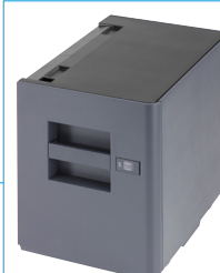
PF-7120 3,000 Sheet Side Deck (Letter)