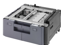
PF-740 (B) 2 x 1,500 Sheet Tray (Letter)