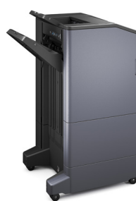
DF-7130 4,000 Sheet Finisher 100 Staple / 100 Manual Staple