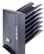
MT-730 (B) 7 Bin Mailbox