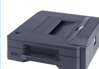
PF-7130 500 Sheet MPT